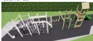
An example of a possible improvement to our lower playground.